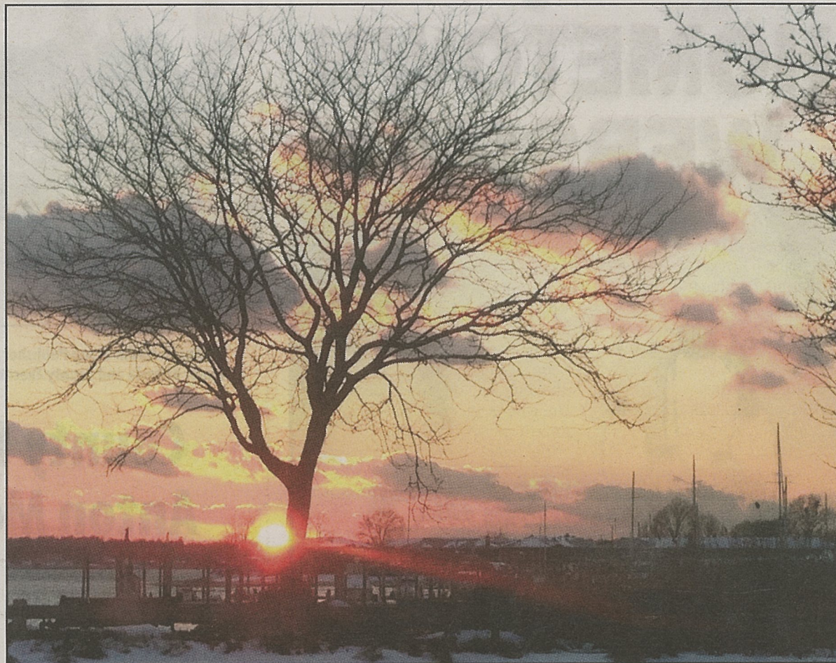
Winter Sunset Photo