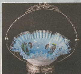
Victorian bride's basket