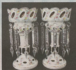
White cut to cranberry lusters