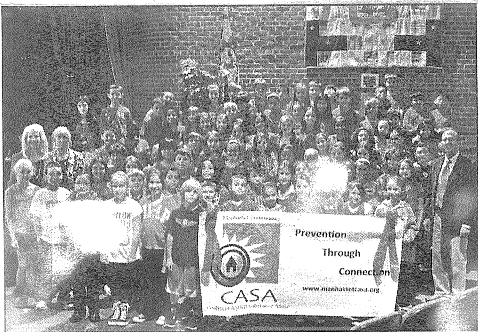
Students learned healthy decision-making.