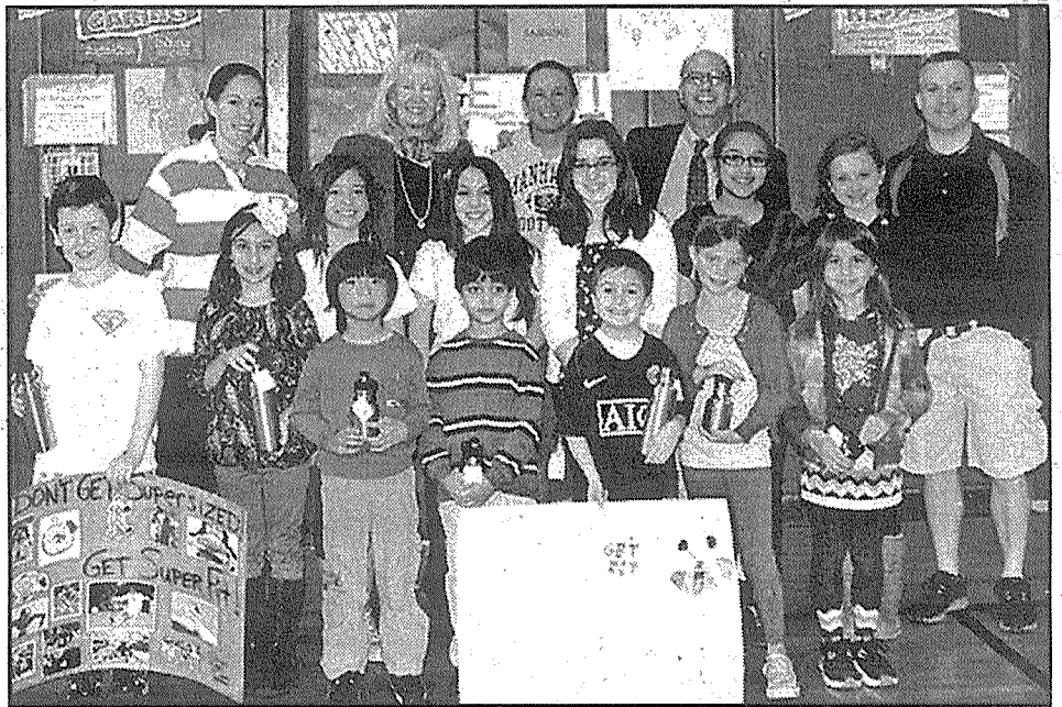
To kick off Manhasset's Health and Fitness Week, poster-contest winners from Munsey Park Elementary School were each awarded a Planet Manhasset water bottle ...

On Friday, March 16, the secondary school's SCA meeting will also offer information to parents about the upcoming week's happenings, which include fitness