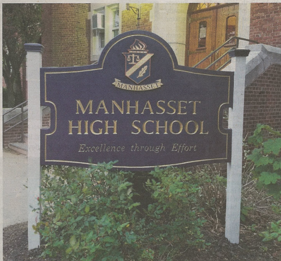
Manhasset High School

School board trustees said they will continue to take proactive measures, as alcohol abuse and drug-taking are prevalent issues impacting youth of all ages.