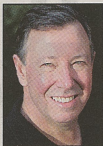
FROM THE EDITOR

Please enlighten parents that this is nothing to be ashamed of. Regardless of their "social status," they need to bring