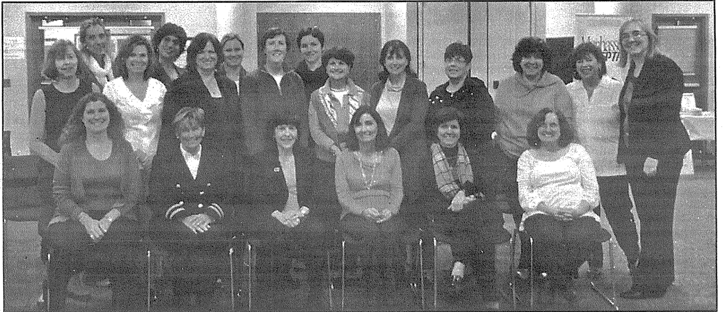
Directors from the 2011 preschool showcase held recently at the library.